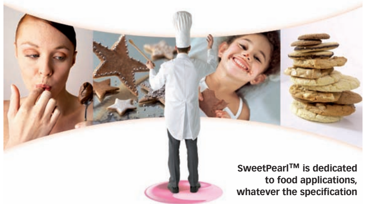
SweetPearl™ is dedicated to food applications, whatever the specification

For smooth, subtle, sweet, creamy chocolates, SweetPearl™ offers unlimited possibilities that will reveal a product's inherent aromas and character. Together with high